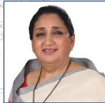
Hon. Smt. Sunetra Ajit Pawar Dy. Chief Minister, Maharashtra State