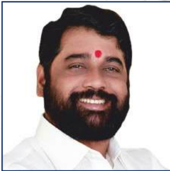
Hon. Shri. Eknath Shinde Dy. Chief Minister, Maharashtra State