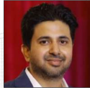
Hon. Shri. Indranil Naik Minister of State, Higher & Technical Education, Government of Maharashtra