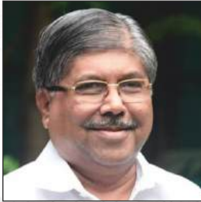
Hon. Shri. Chandrakant Patil Minister, Higher & Technical Education, Government of Maharashtra