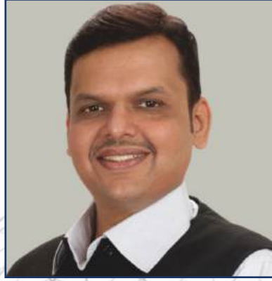
Hon. Shri. Devendra Fadnavis Chief Minister, Maharashtra State